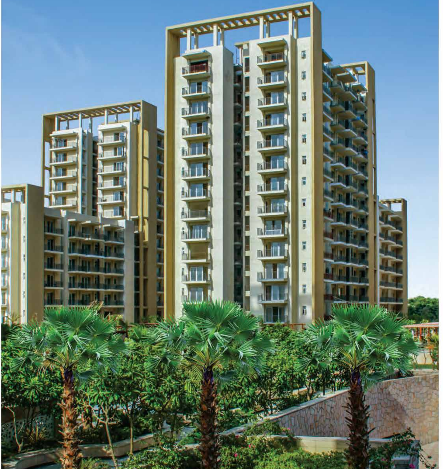
ACTUAL IMAGE OF THE AANANDVILAS COMPLEX