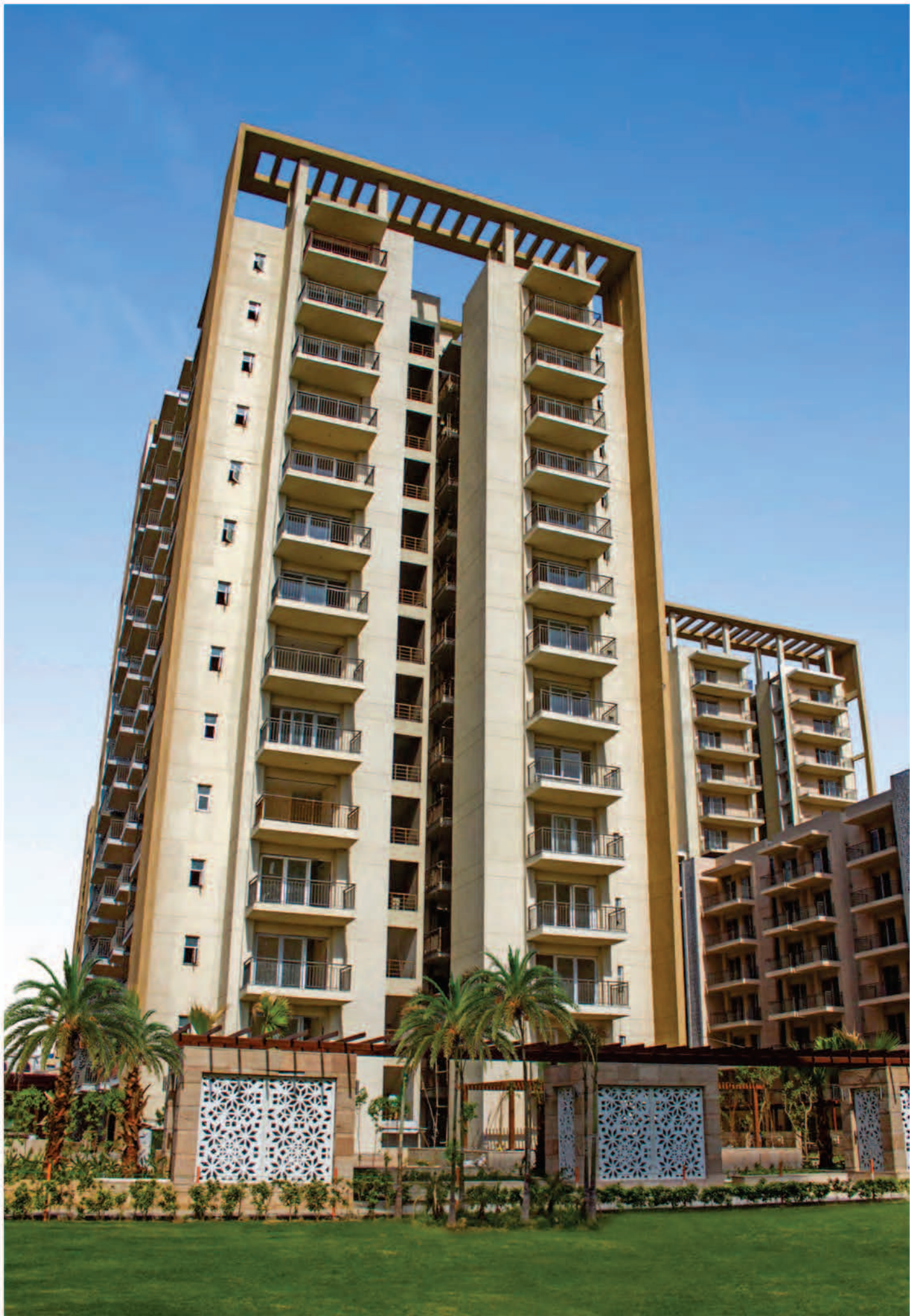
ACTUAL IMAGE OF LANDSCAPED GREENS AND TOWER