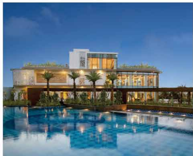
THE CLUB AT EMERALD BAY, GURGAON