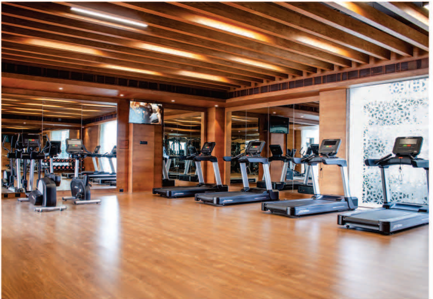
ACTUAL IMAGE OF GYMNASIUM