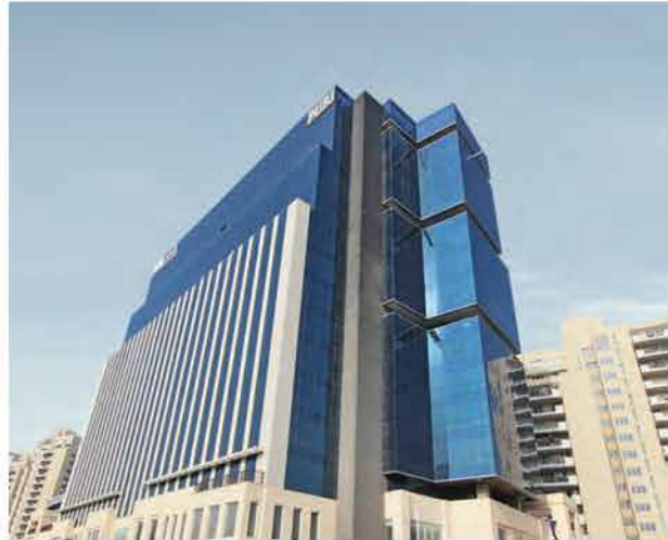
THE PALM SPRINGS PLAZA, GURGAON