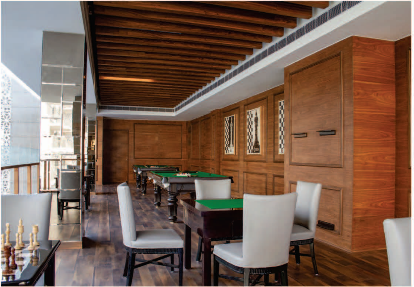
ACTUAL IMAGE OF THE BILLIARDS, CHESS AND CARDS ROOM