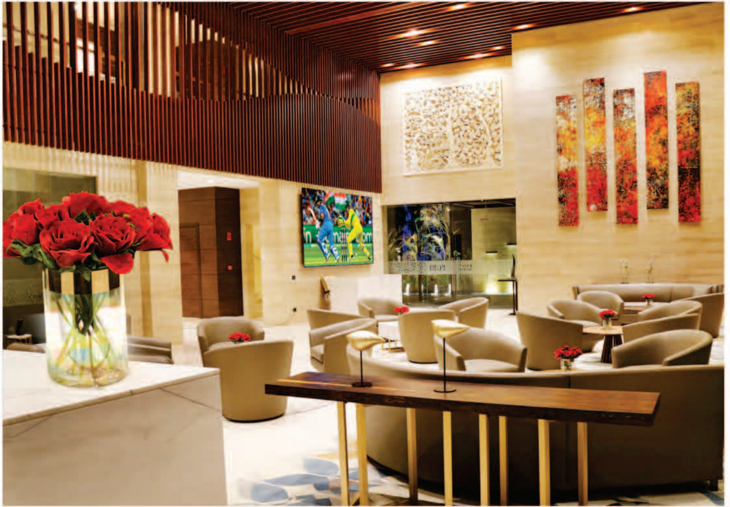
ACTUAL IMAGE OF THE CLUB LOBBY