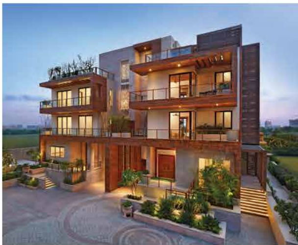
VILLAS AT DIPLOMATIC GREENS, GURGAON