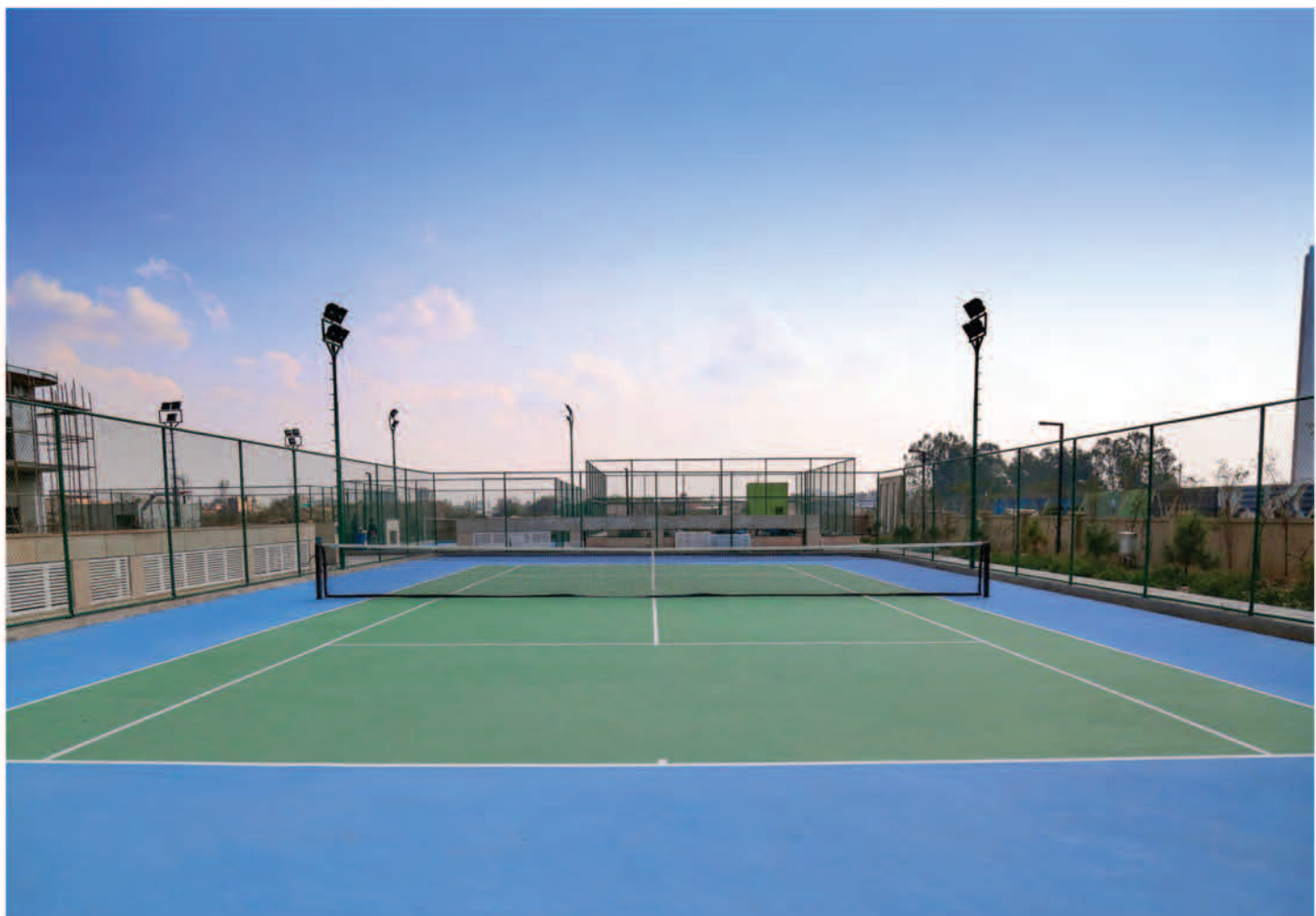
ACTUAL IMAGE OF THE TENNIS COURT