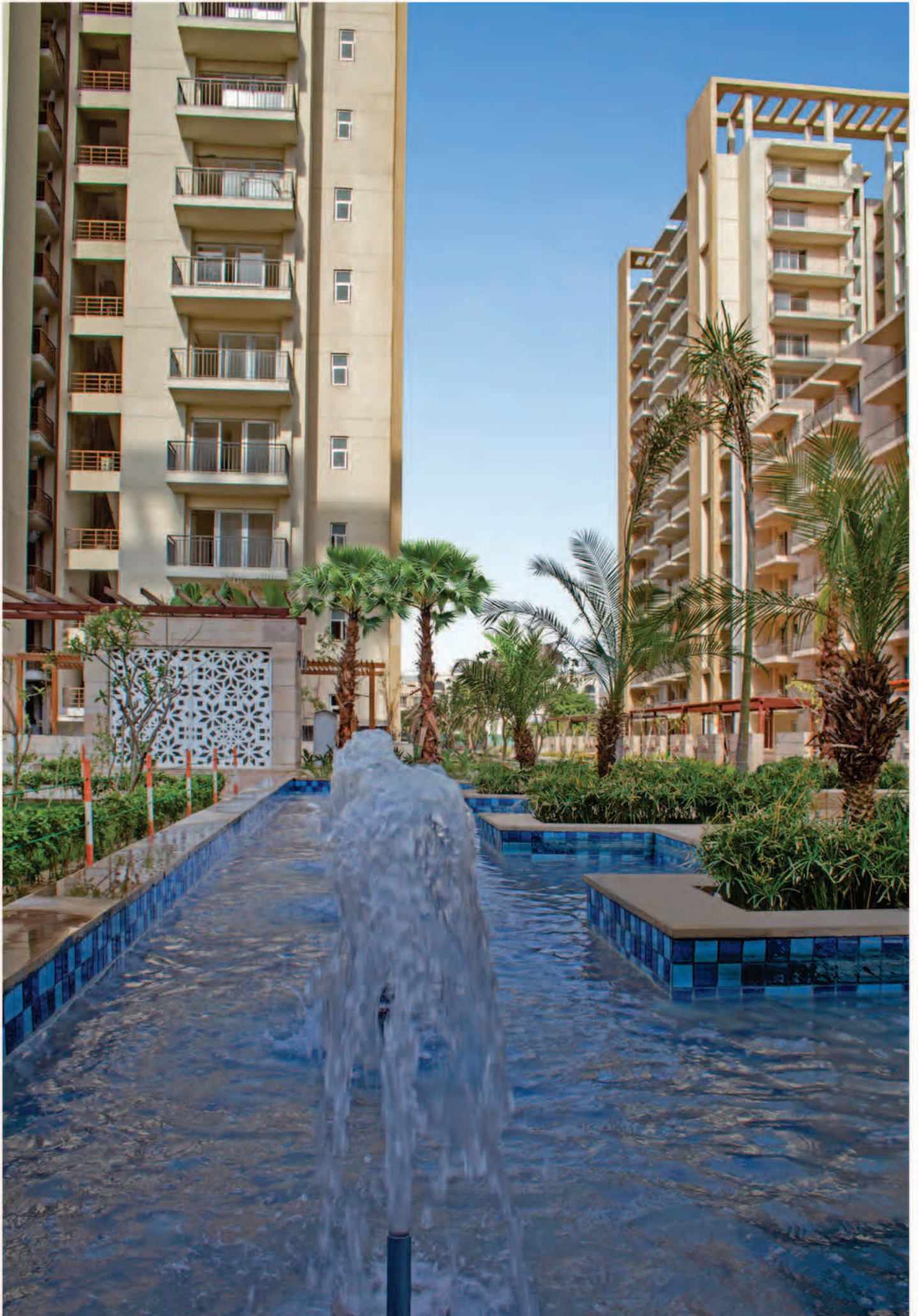
ACTUAL IMAGE OF THE WATER FEATURE