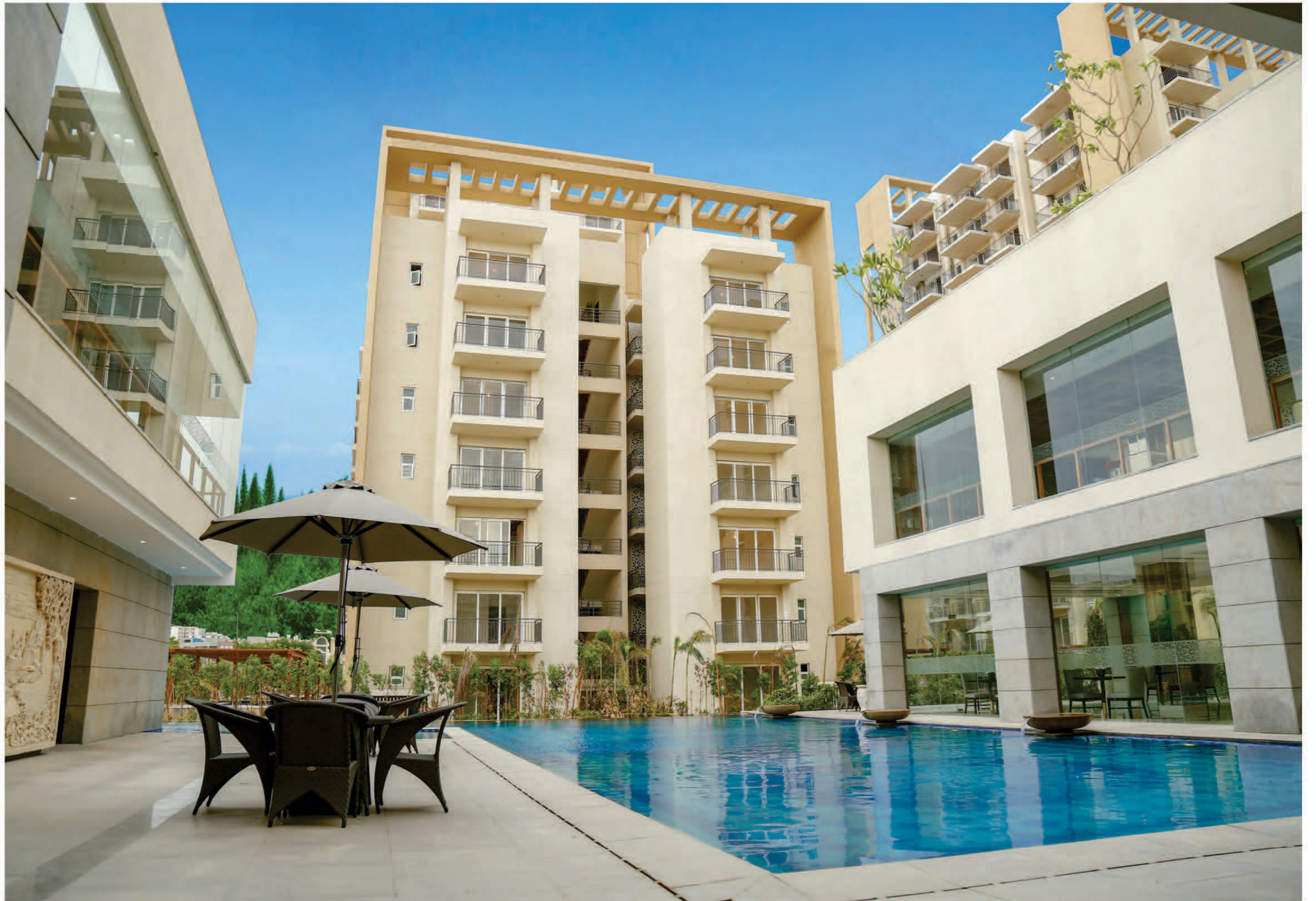
ACTUAL IMAGE OF THE POOL PARADISE RIGHT IN THE HEART OF AANADVILAS