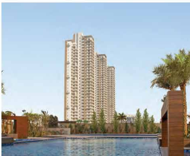
THE EMERALD BAY, GURGAON