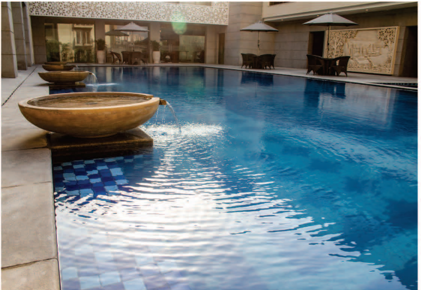
ACTUAL IMAGE OF THE POOL DECK