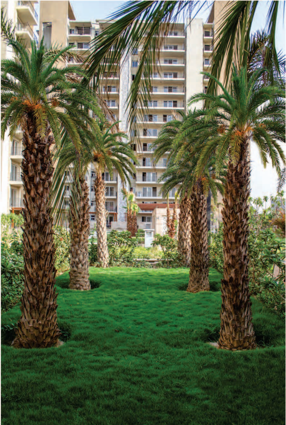
ACTUAL IMAGE OF LANDSCAPING