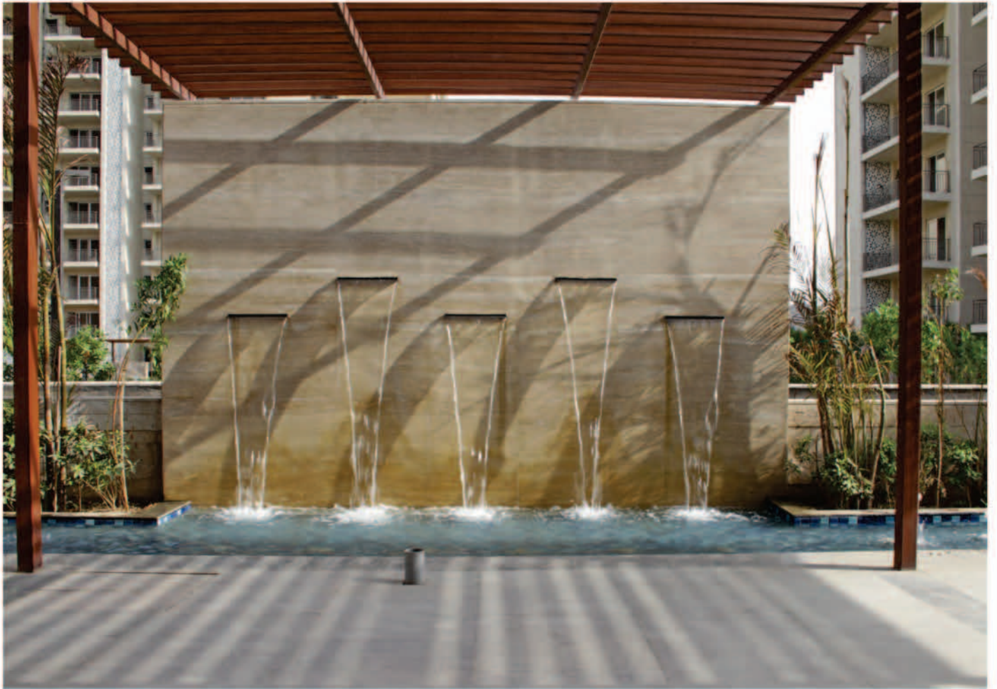
ACTUAL IMAGE OF THE WATER FEATURE