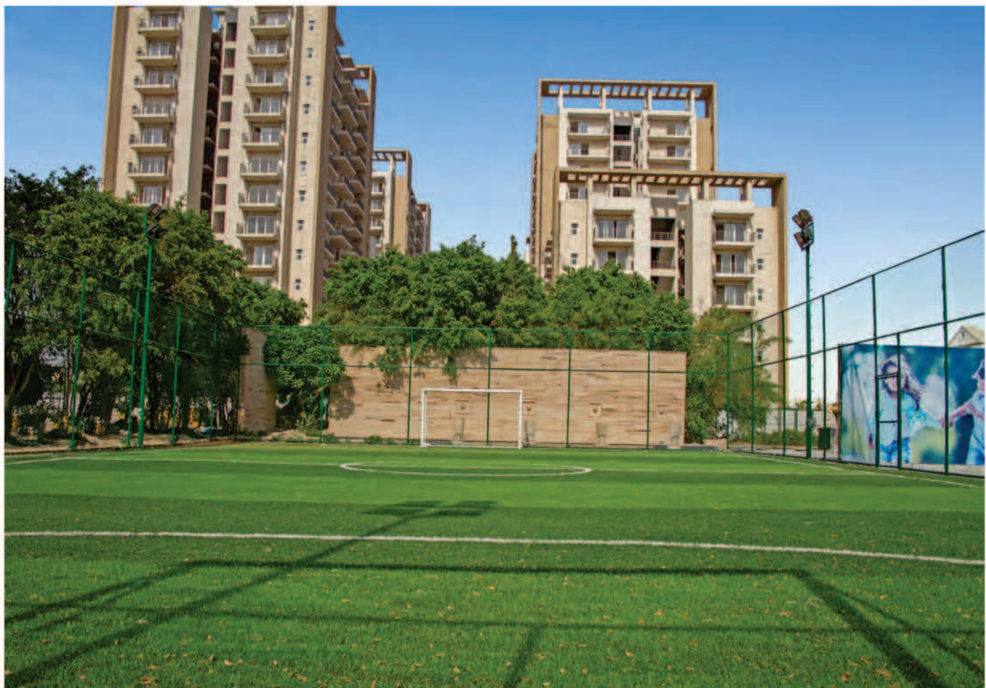
ACTUAL IMAGE OF THE FLOOD LIT SOCCER FIELD