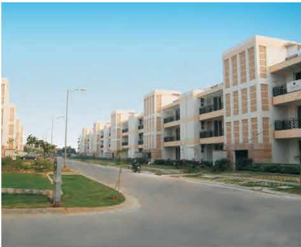
V.I.P FLOORS, FARIDABAD