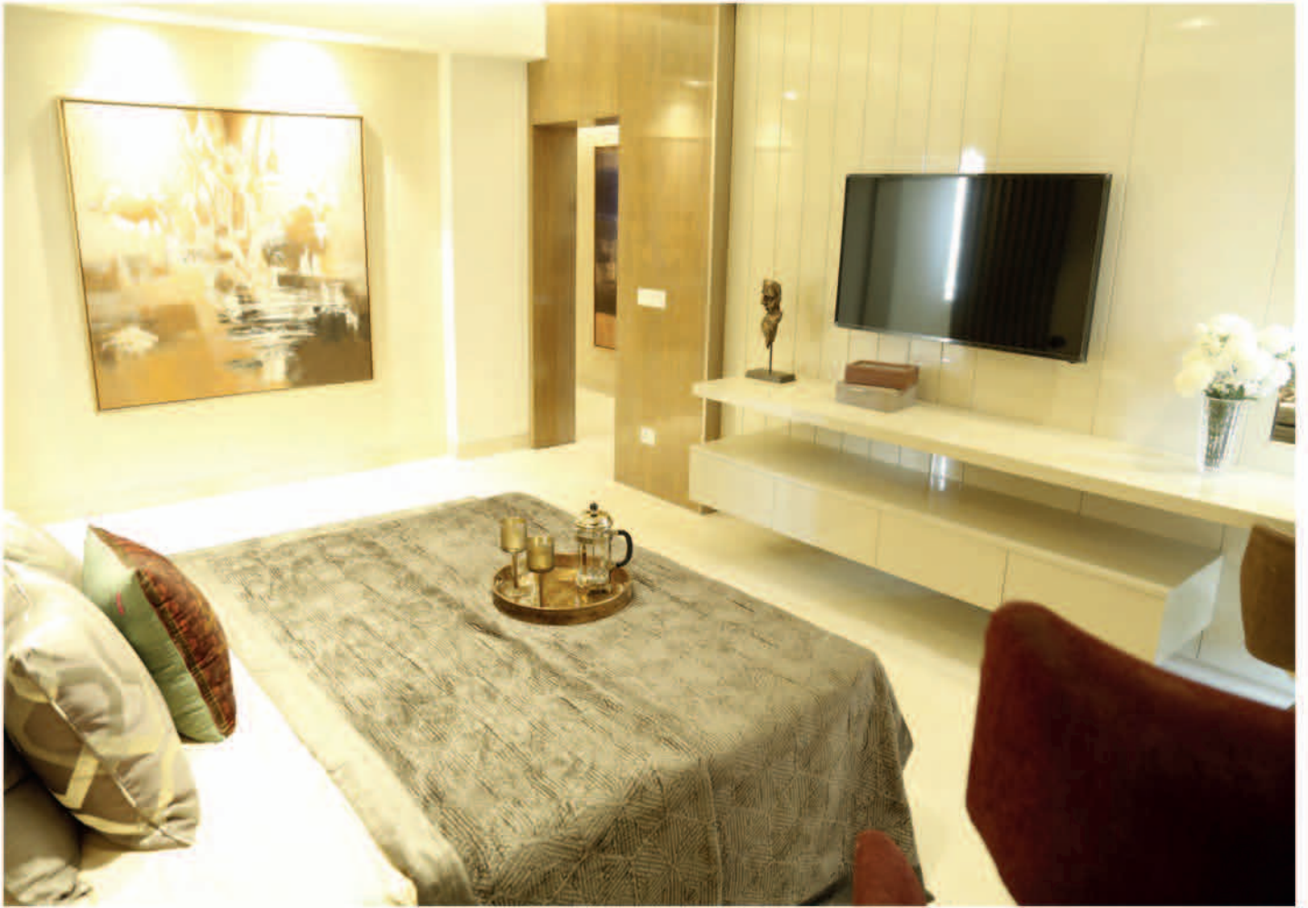
ACTUAL IMAGE OF THE SAMPLE APARTMENT