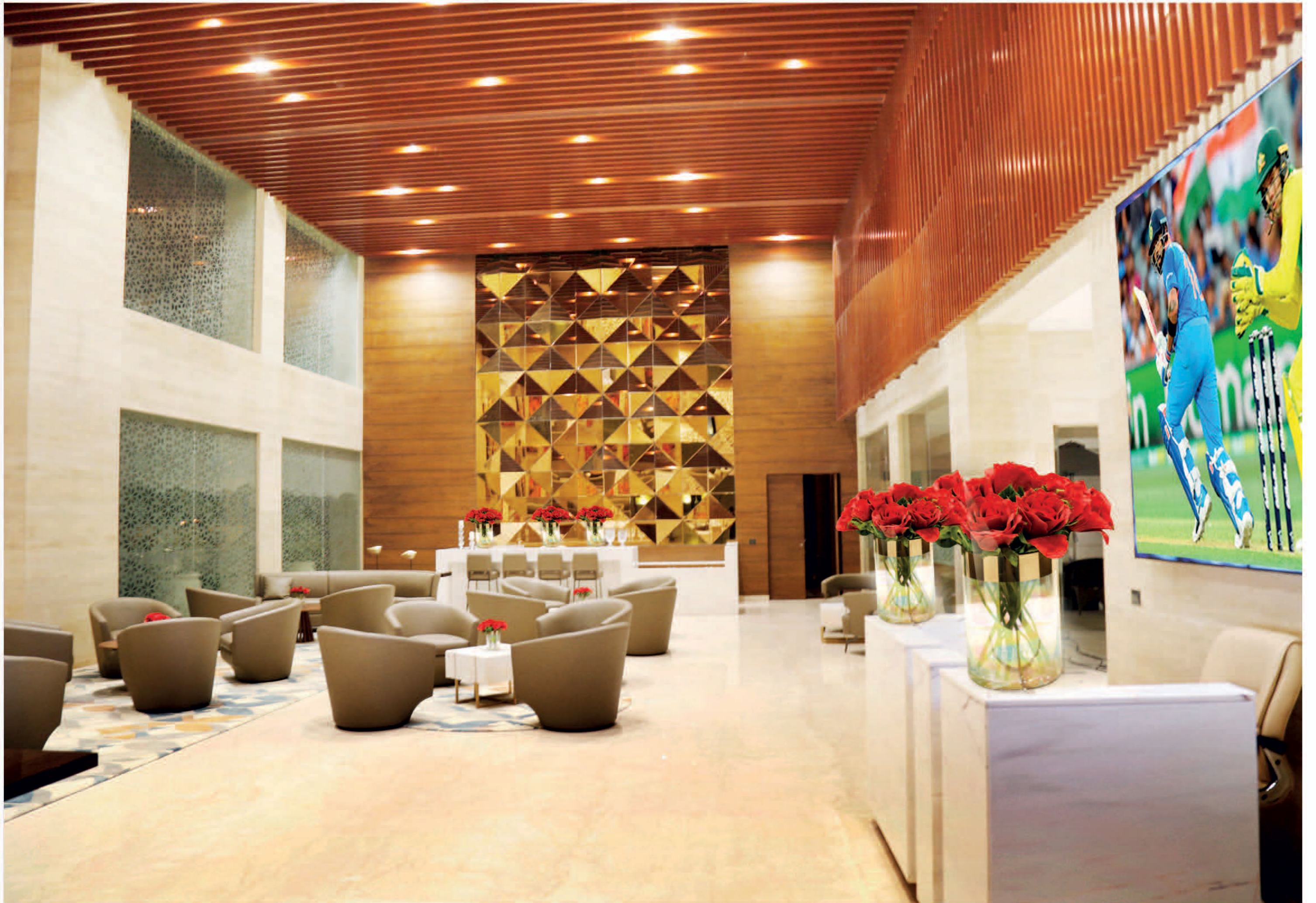
ACTUAL IMAGE GRAND LOBBY OF THE AANANDVILAS CLUBHOUSE