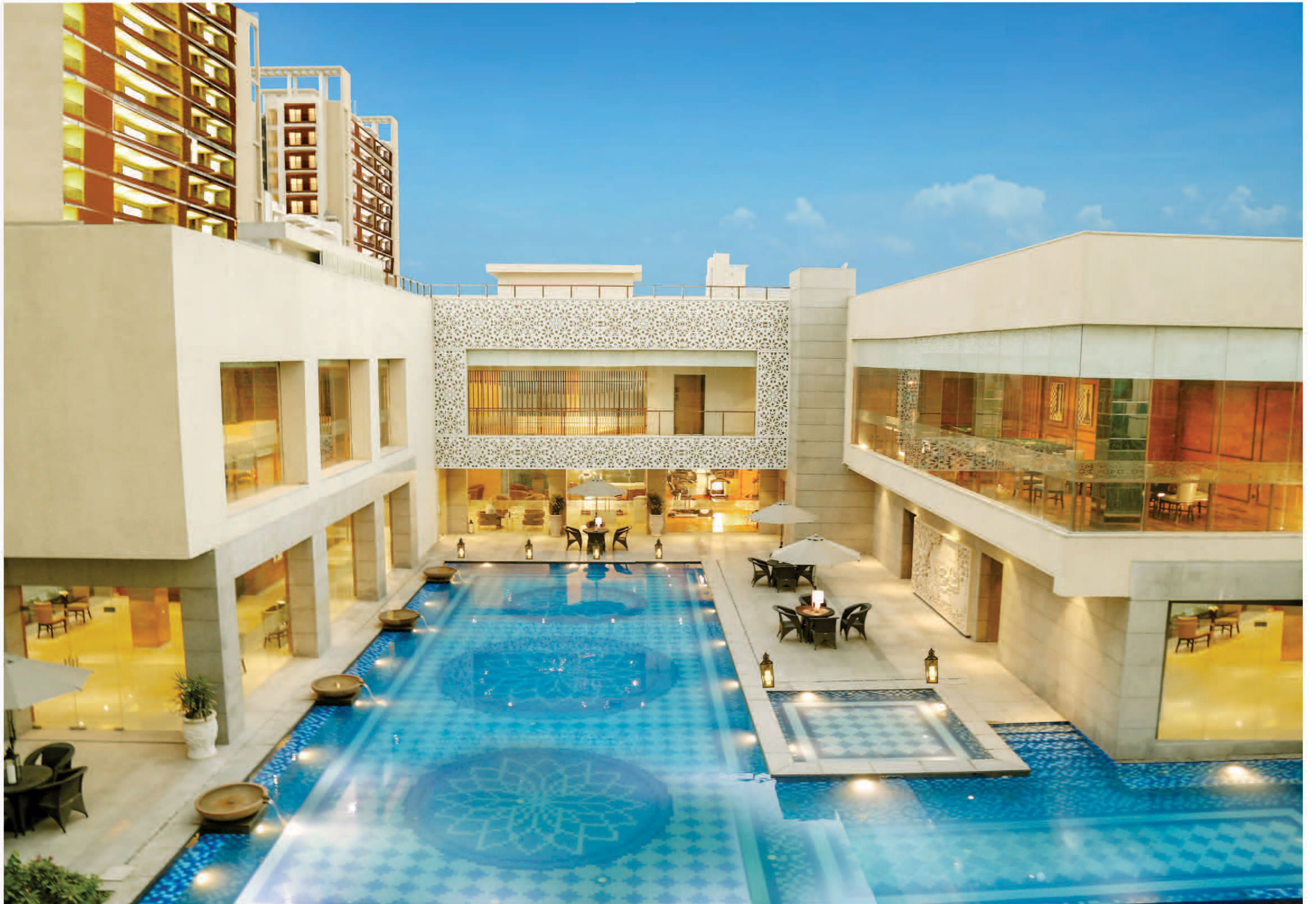
ACTUAL IMAGE OF THE POOL DECK