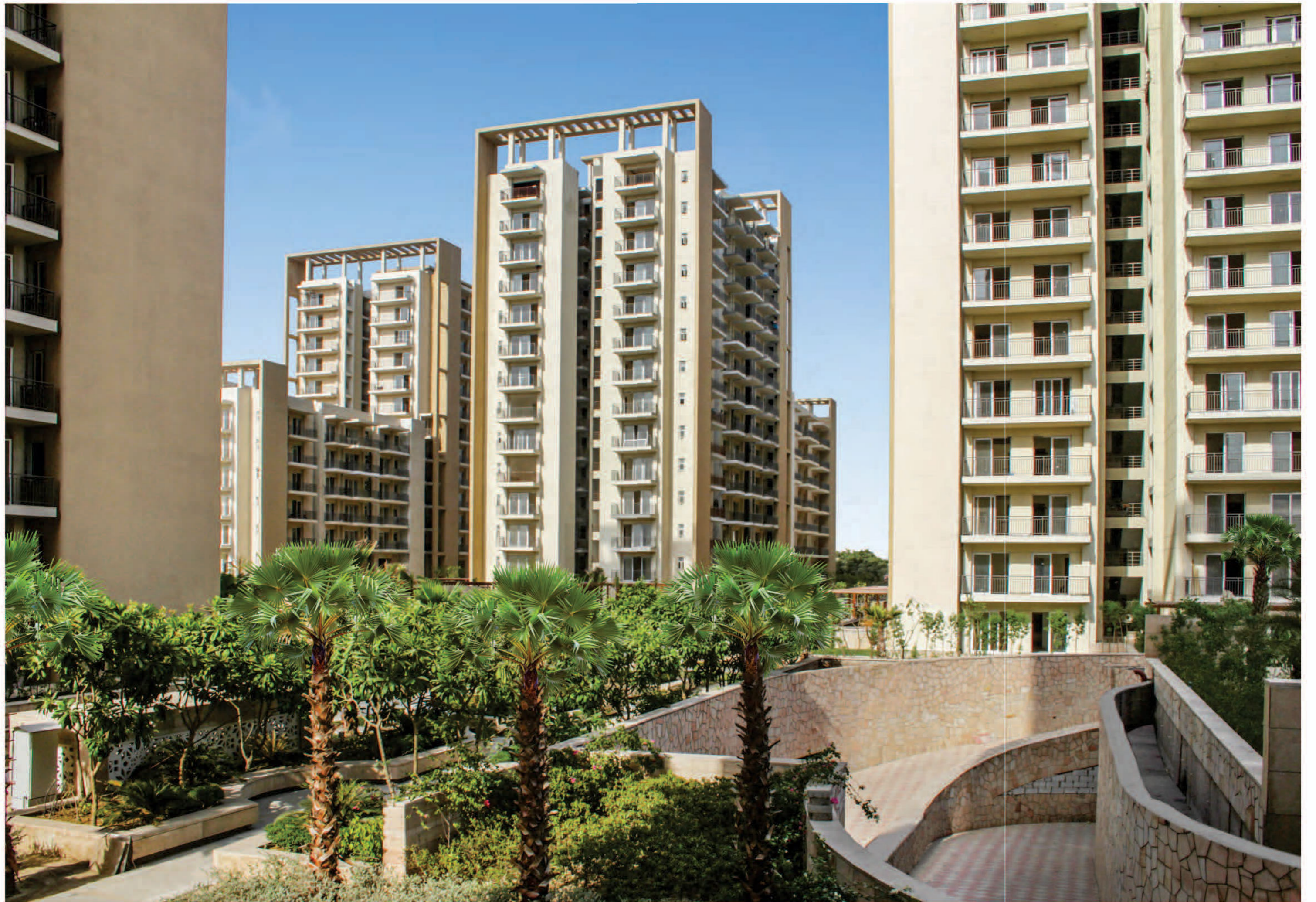
ACTUAL IMAGE OF THE STRAIGHT LINE MODERN ARCHITECTURE