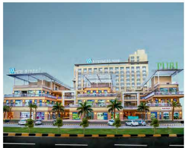
81 HIGH STREET, FARIDABAD