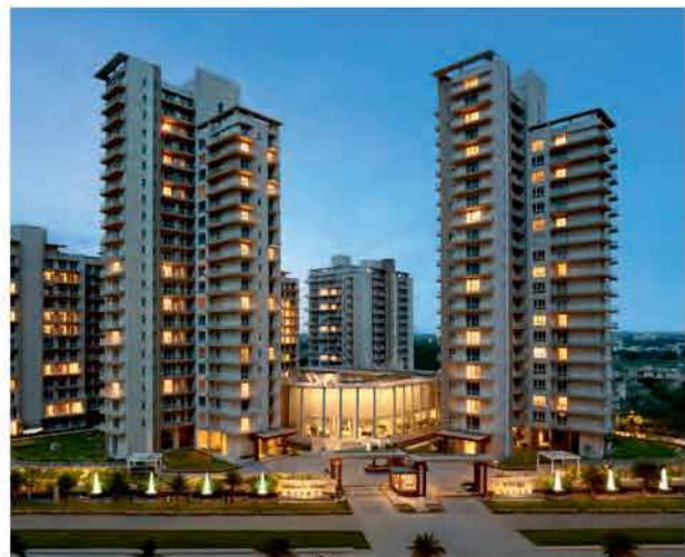
DIPLOMATIC GREENS, GURGAON