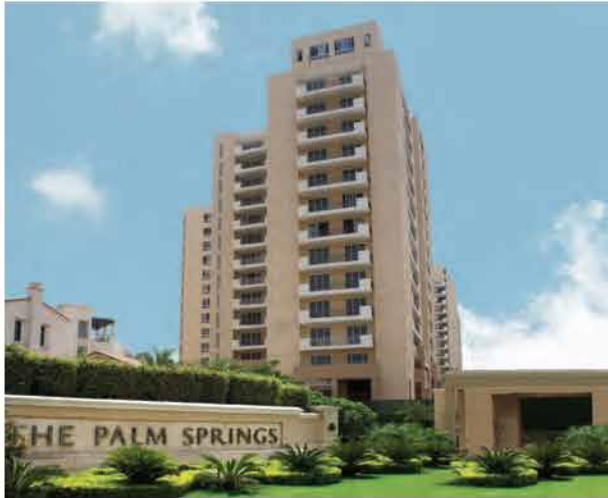
THE PALM SPRINGS, GURGAON