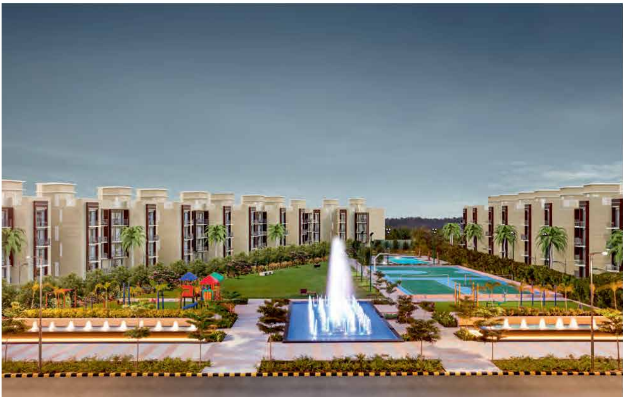
LUXURIA FLOORS AT AMANVILAS, FARIDABAD