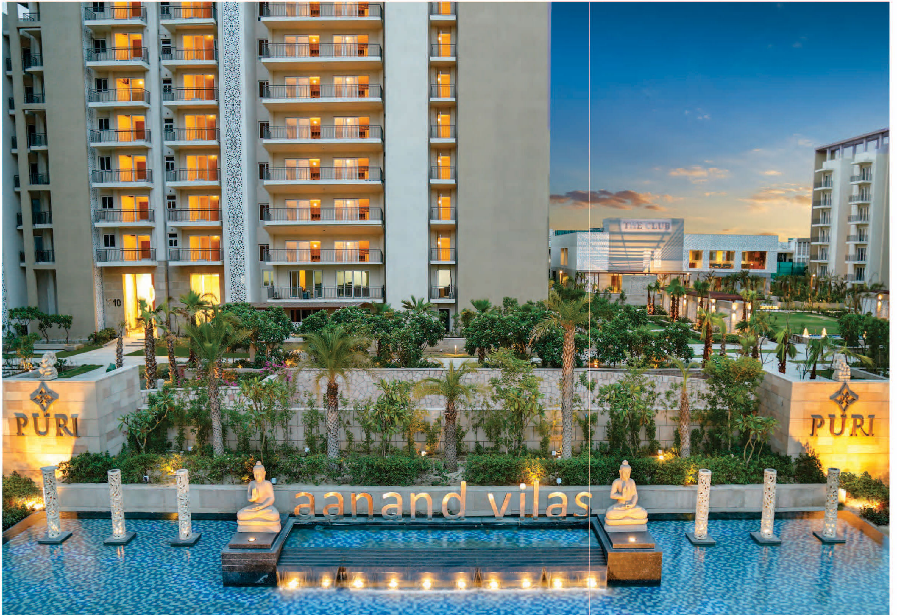
ACTUAL IMAGE OF THE GRAND ENTRANCE PLAZA