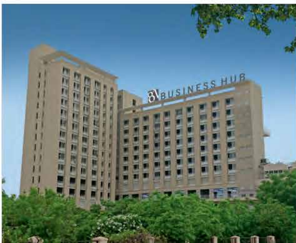
81 BUSINESS HUB, FARIDABAD