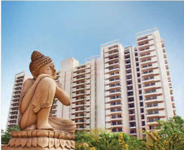
THE PRANAYAM, FARIDABAD