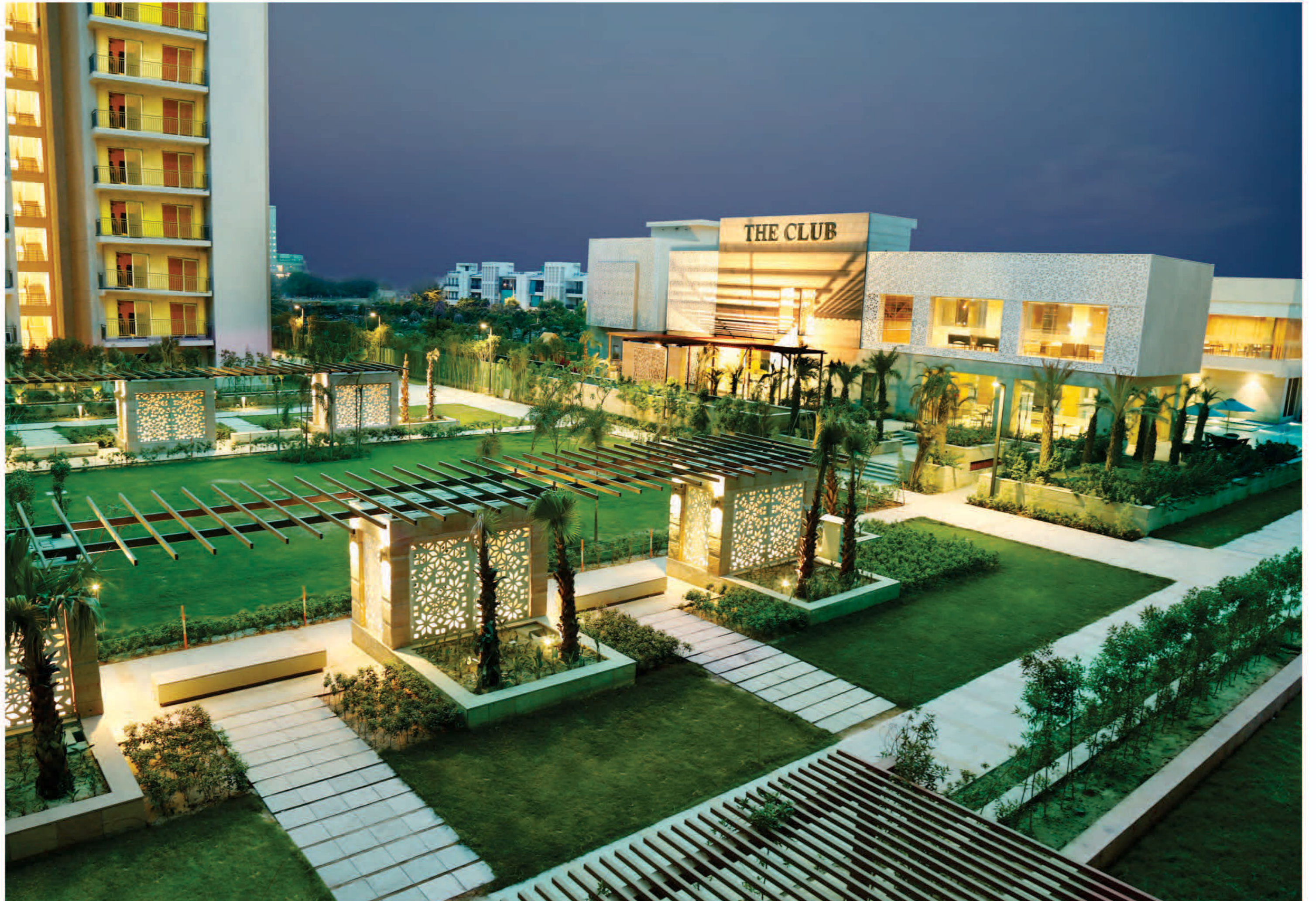
ACTUAL IMAGE OF THE CLUB WITH WELL LANDSCAPED AREA