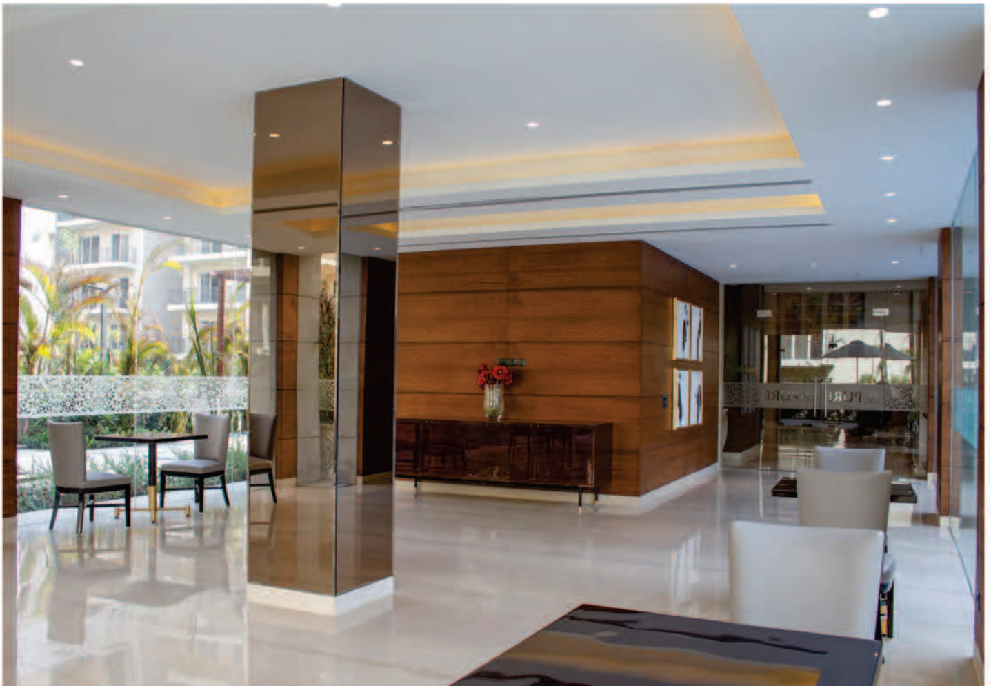
ACTUAL IMAGE OF THE MULTI PURPOSE HALL