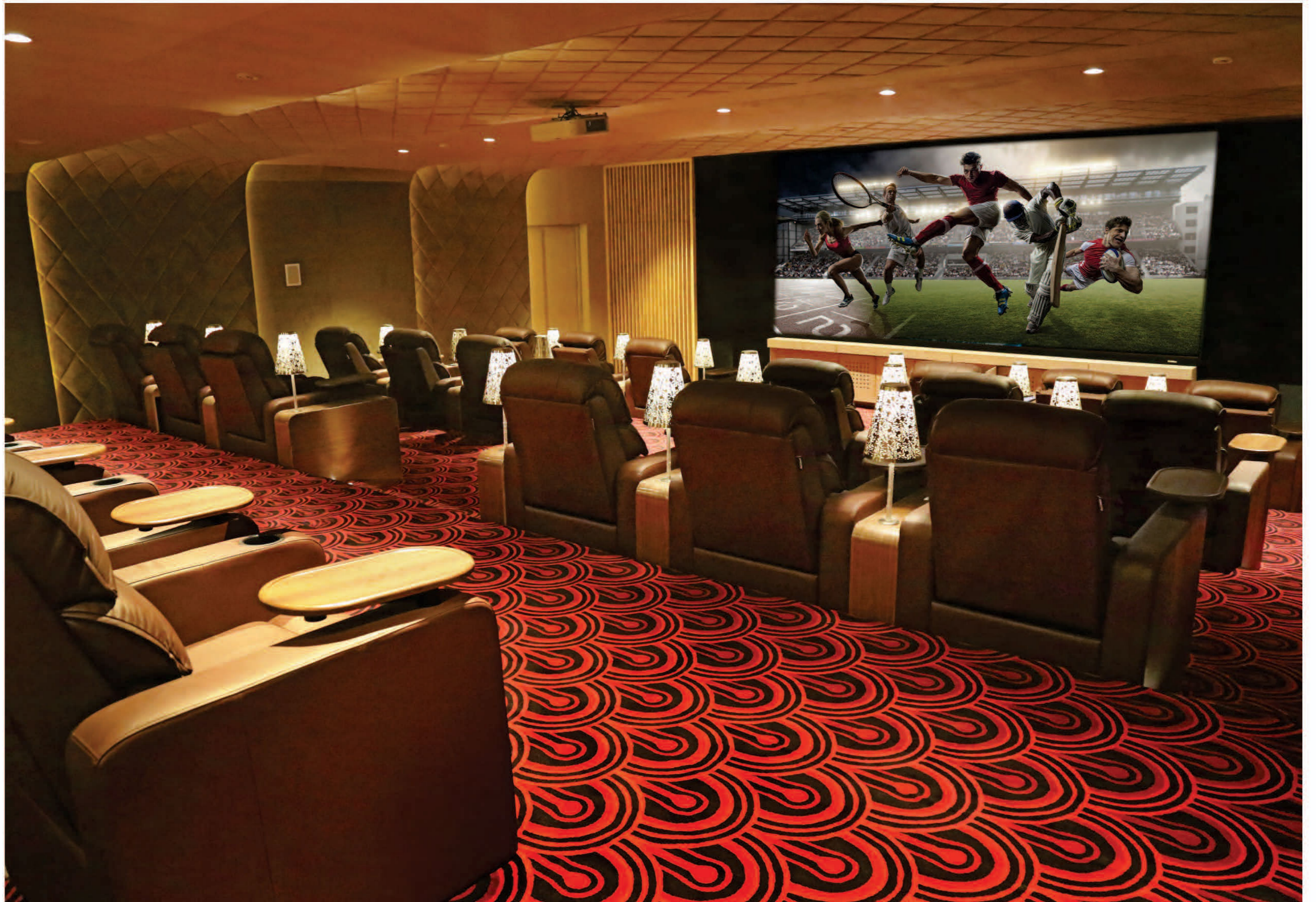
ACTUAL IMAGE OF PRIVATE MOVIE THEATRE