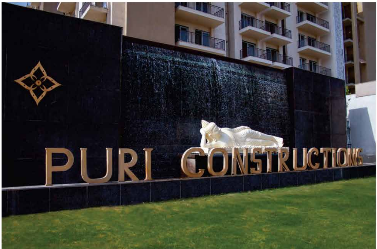
ACTUAL LANDSCAPING AT AANADVILAS, FARIDABAD