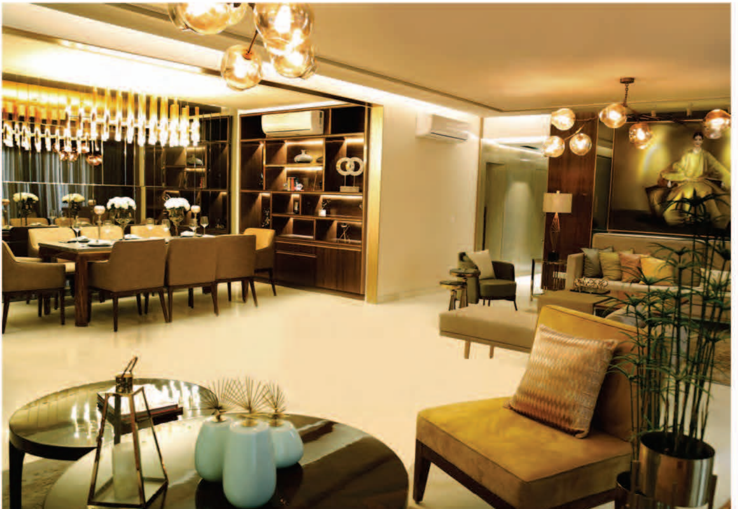
ACTUAL IMAGE OF THE SAMPLE APARTMENT