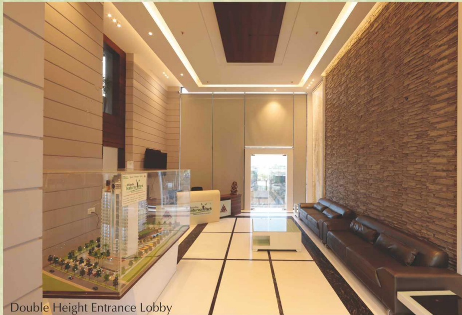
Double Height Entrance Lobby

Ahinsha Naturez Park WHERE NATURE MEETS STATURE.